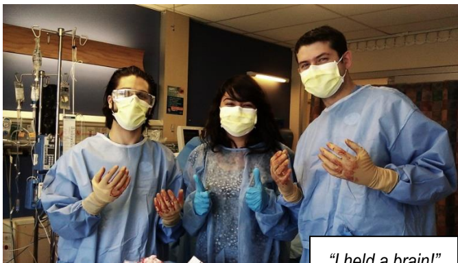
"I held a brain!"

"I got blood on my scrubs & antibacterial solution on my shoes and you know what, I still know I'm going to be a doctor!"