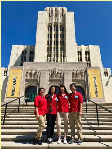
College Bound High School Students