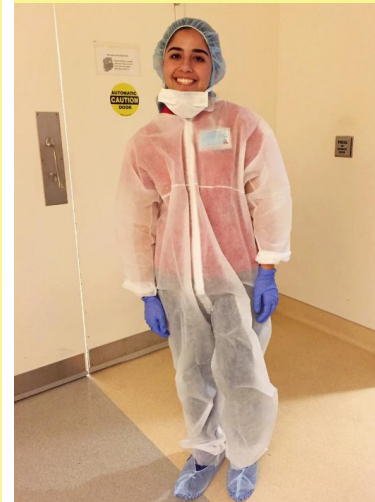
Summer Internship Program